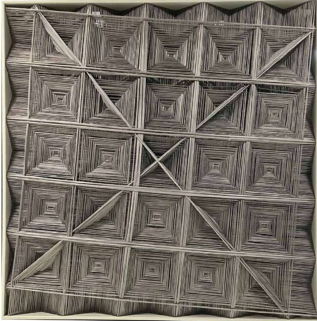
Stable bifurcation- Grey, 2010