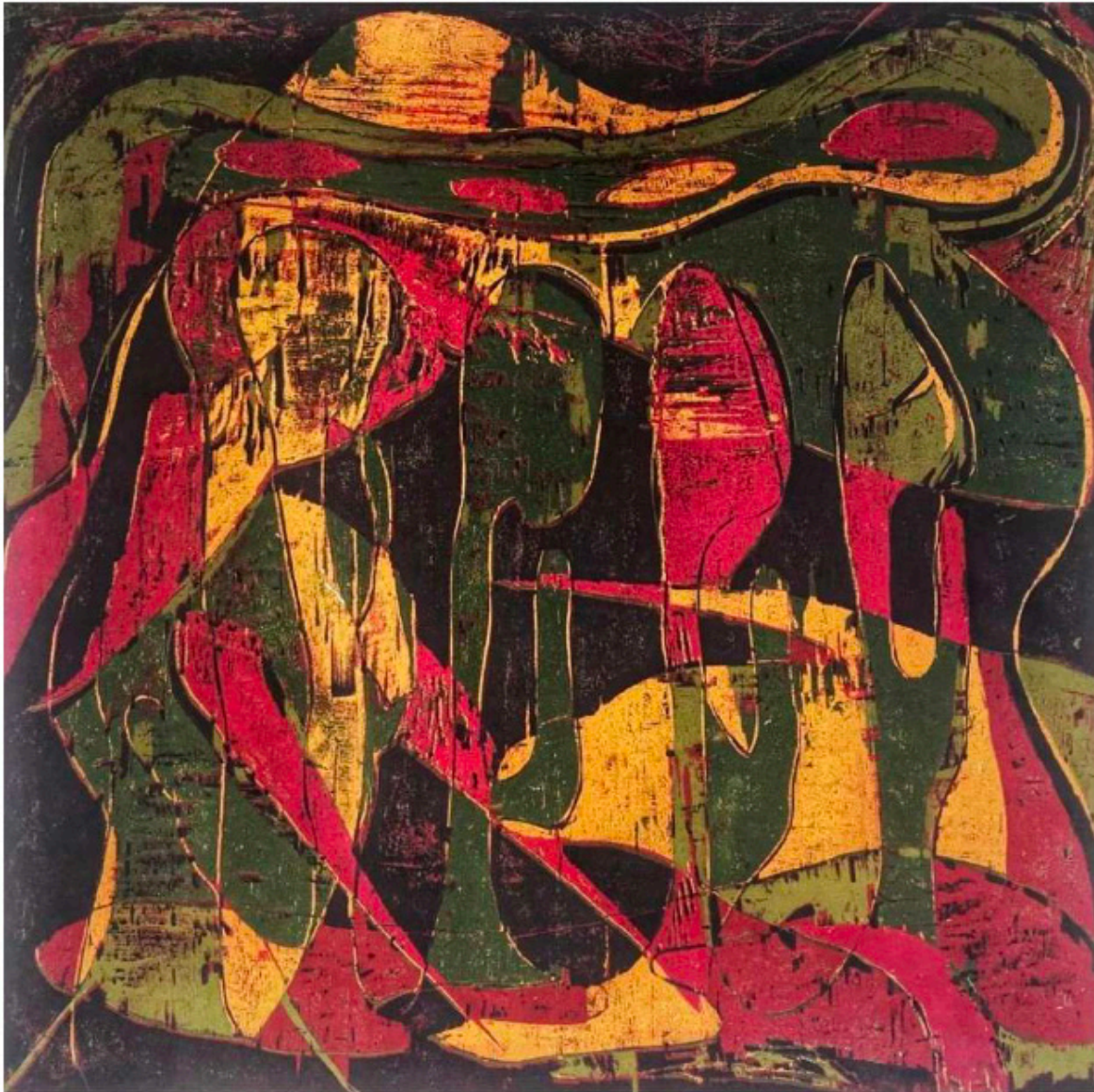
Ece Abay Kerici Dark Prayers ( Dreamscapes Series ) 2016 60 x 60 cm Woodcut on paper